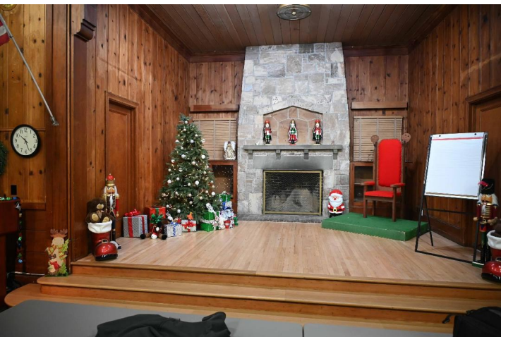
Stage after decorating complete.