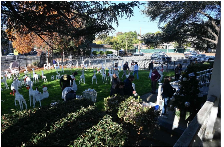
Everyone decorating away!