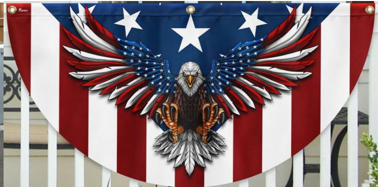
Clubhouse decorations were great for the event to honor our Veterans